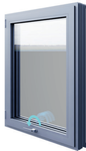
Handle pointing to the left: window is closed

The really clever bit is that when you want to close this tilted-in window, there is no need to reach up to the top of the open window to push it shut. Just turn the handle back again and the mechanism will close the window for you.