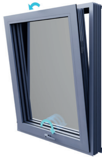
Handle pointing to the right: window tilts inwards on bottom hinges

Push the window shut and turn the handle through another quarter turn and the window will tilt inwards on bottom hinges to provide ventilation.